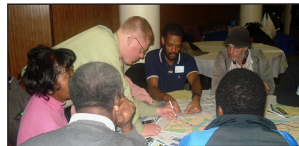
The 30s Line recommendations were discussed by participants at the December public meetings.

Over the last six months of 2007, the Washington Metropolitan Area Transit Authority (WMATA), in partnership with the District Department of Transportation (DDOT), studied ways of improving transit service on the 30s Line corridor. The line, currently made up of Metrobus routes 30, 32, 34, 35, 36, and M6, receives about 20,000 riders every weekday, making it the most heavily used in the Metrobus system.