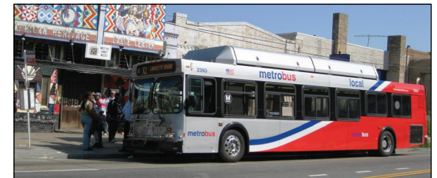
A new local bus stops to pick up riders along the X2 route. Metro is reviewing recommendations to improve service along the Benning-H corridor.

(Please see inside for details about the improvements.)